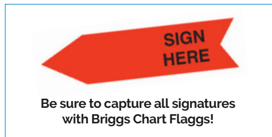
Parts 2 & 3